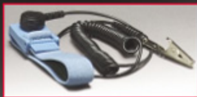
Anti-Static wrist strap